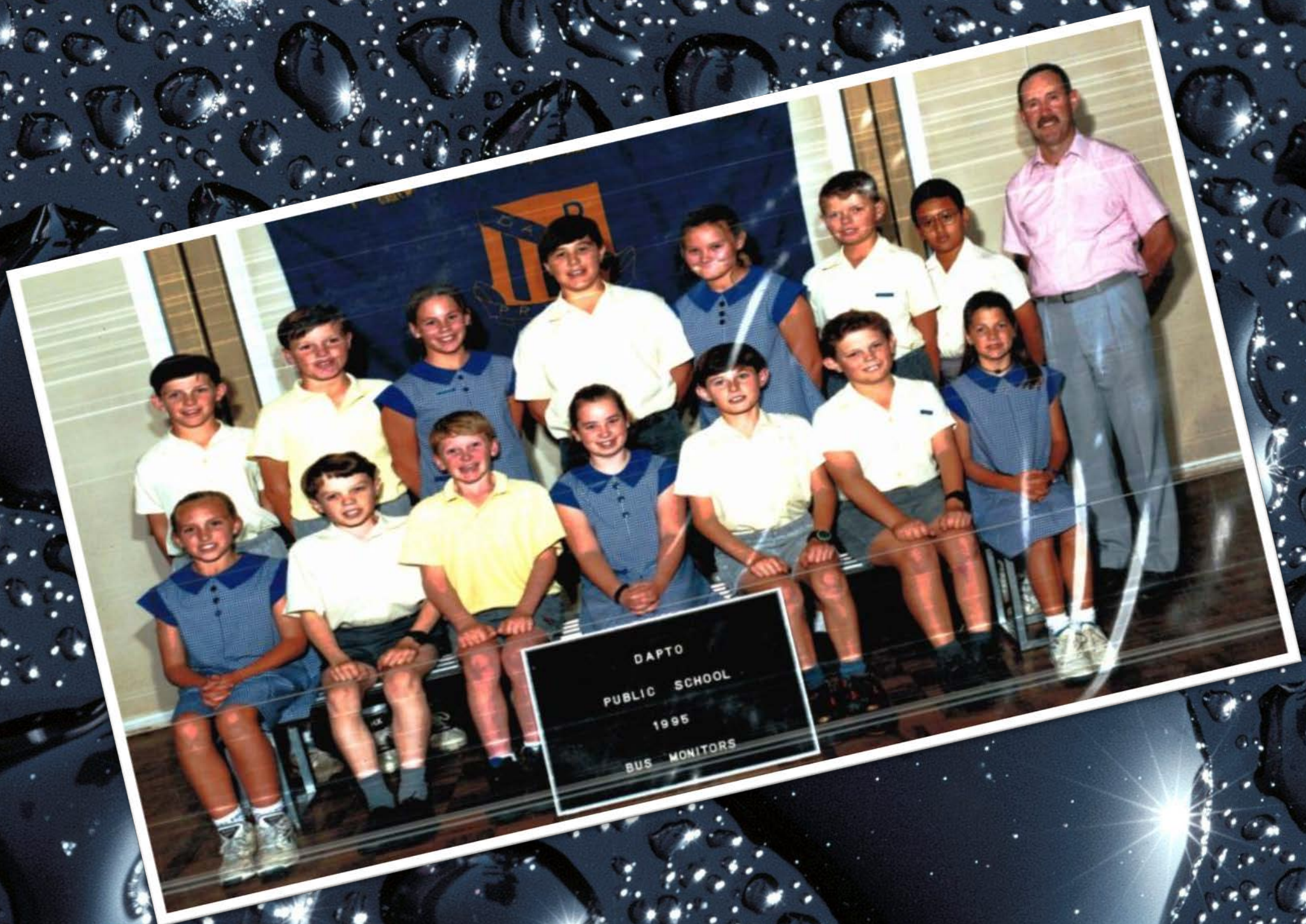
DAPTO PUBLIC SCHOOL 1995 BUS MONITORS