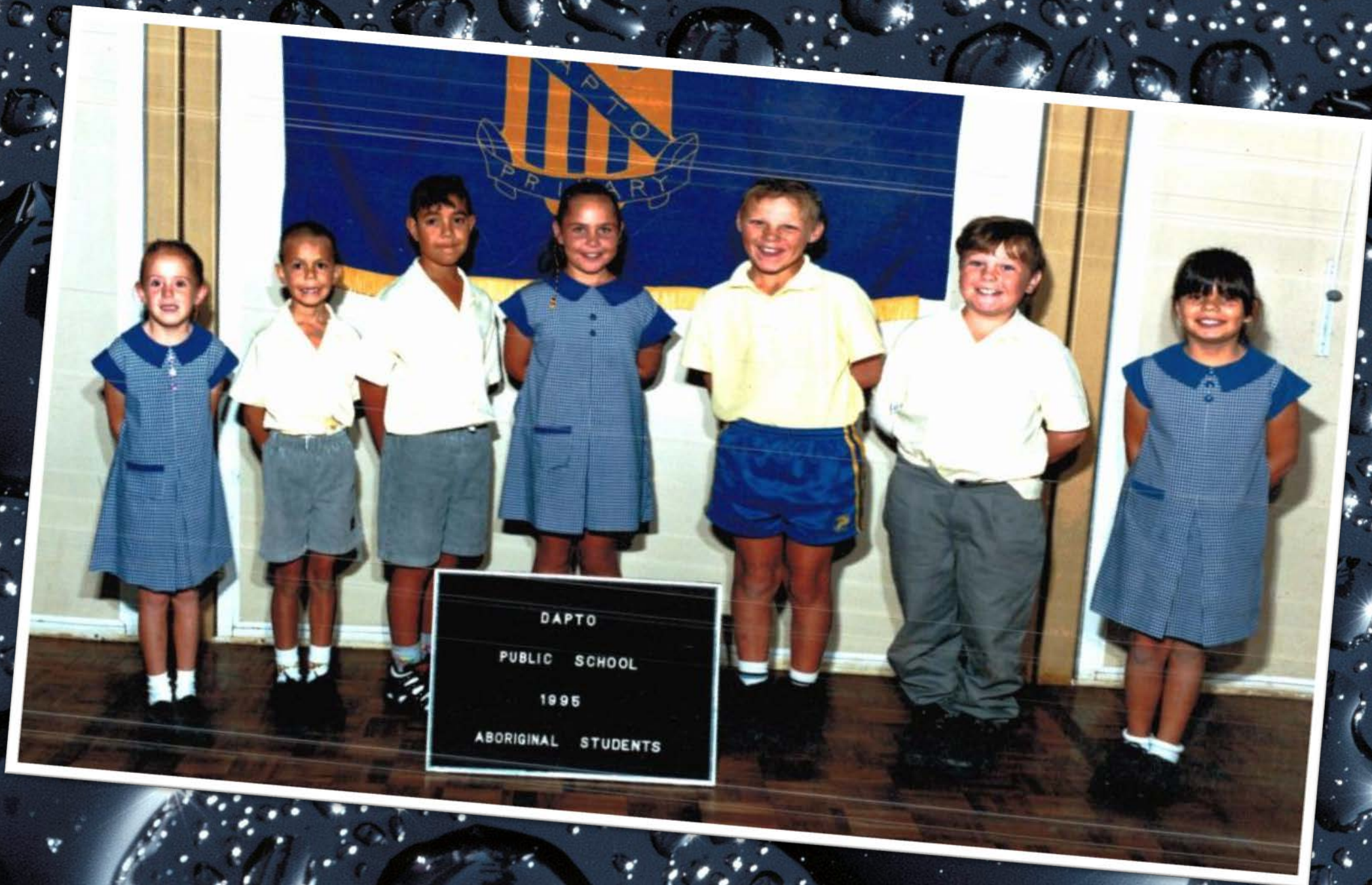
DAPTO PUBLIC SCHOOL 1995 ABORIGINAL STUDENTS